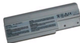
( Item Code: LWI004)

More Info fast shipping 3-5 days arrive.