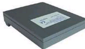
( Item Code: LWI002)

More Info fast shipping 3-5 days arrive.