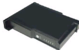
( Item Code: LWI001)

More Info fast shipping 3-5 days arrive.